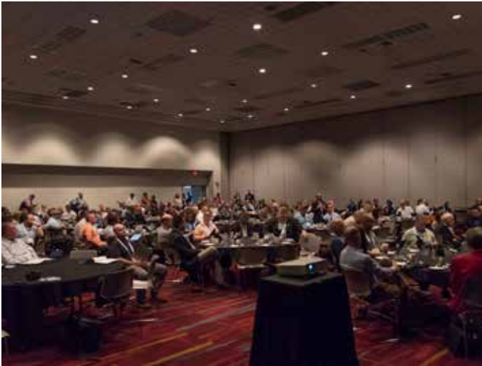
Attendees prepare for a day of informative presentations during the InfraGard Conference.