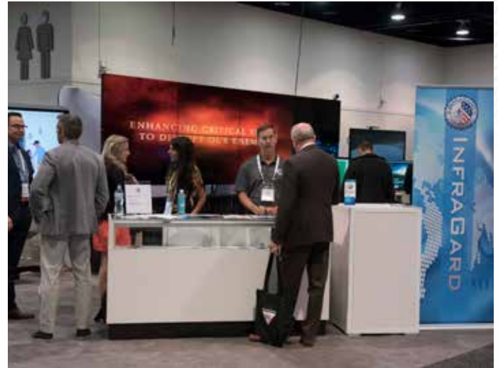
GSX and InfraGard Conference attendees stop by the InfraGard booth to learn more about the organization, its mission and how to get involved.