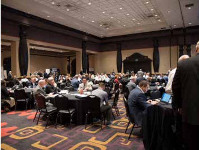
InfraGard chapter presidents and FBI Private Sector Coordinators from across the country assemble in the ballroom at Planet Hollywood for InfraGard Congress.