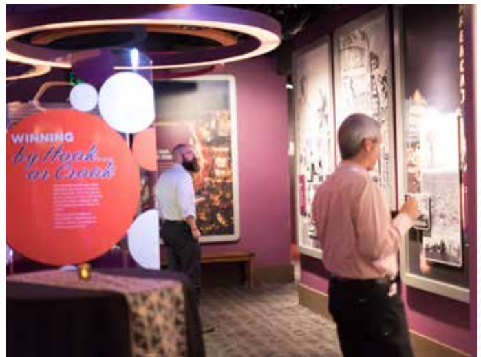
InfraGard members took the opportunity to experience numerous exhibits at the Mob Museum and learn more about the history of organized crime and its impact on American society.