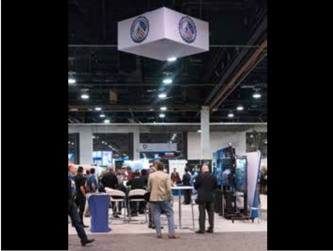
The InfraGard booth on the GSX Show floor features exhibits from the FBI, corporate sponsors and strategic partners.