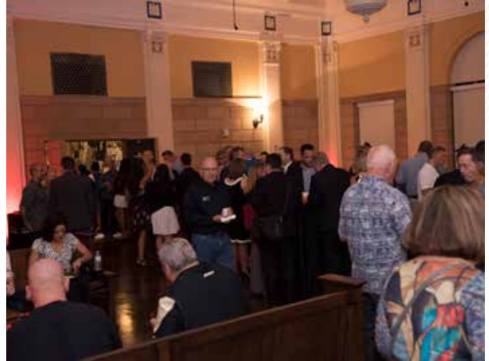
Guests enjoyed an unforgettable evening during InfraGard Night at the historic Mob Museum in downtown Vegas.